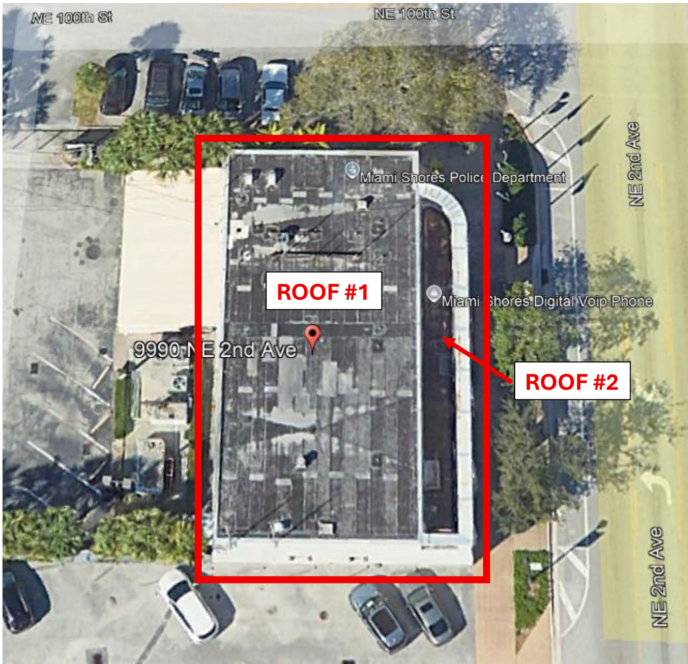
LOCATION OF WORK